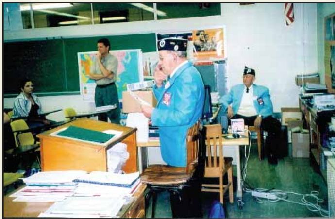
CID 24 speakers at Tell America presentation