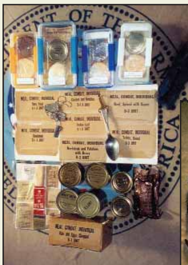
CID 108's Tell America presentation includes a display of what veterans ate in Korea,